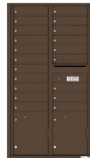
STD-4C Wall-mounted Mailboxes