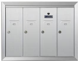
Vertical Recessed or Surface Mounted

The Vertical and Horizontal Mailboxes do not meet current USPS requirements for Centralized Mail Delivery. When an apartment community or other multi-unit dwelling is renovated, the property should replace the obsolete mail receptacles with the current USPS STD-4C mailboxes or CBU mailboxes.