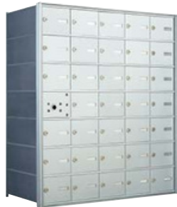
Horizontal Recess Mounted