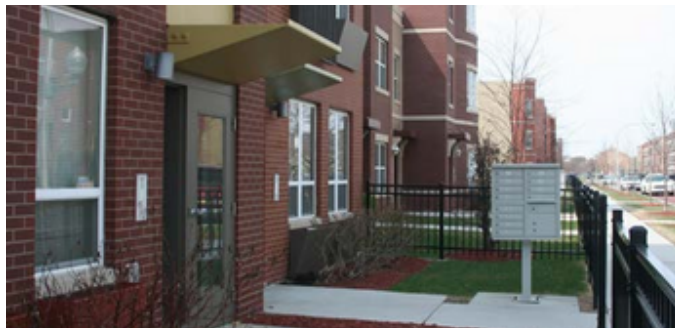
Cluster Box Units