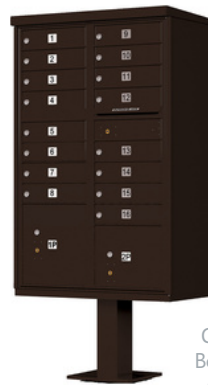
Cluster Box Unit (CBU)