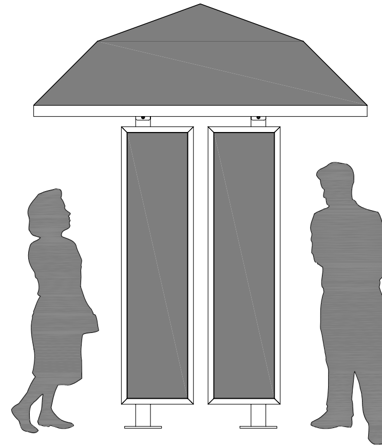
MAILBOXES AS SHOWN MOUNTED ON FRONT AND BACK OF SHELTER.